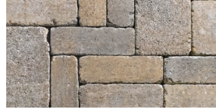
South Mountain Sand