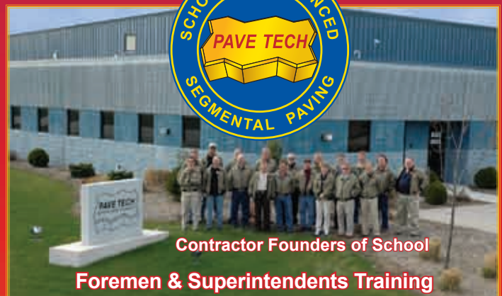
Contractor Founders of School