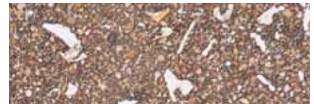
A80047 Ground Tudor® Finish : 36.3%

loop industrial cycle. By specifying Hanover® Asphalt Block, you support the recycling process.