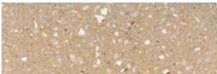
M2988 Ground Tudor® Finish