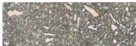
A80046 Ground Tudor® Finish : 36.3%