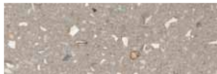
M3375 Ground Tudor® Finish