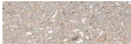
M3372 Ground Tudor® Finish