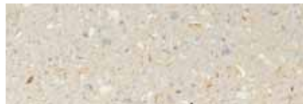
M3371 Ground Tudor® Finish

The addition of recycled clam shells boosts the recycled content of Hanover's Prest® Pavers, helping to earn LEED points and SS Credits.