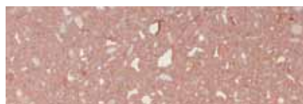
M3376 Ground Tudor® Finish