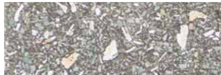
A80046 Ground Finish : 36.3%