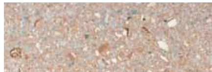
M3374 Ground Tudor® Finish

The colors shown are part of Hanover's Chesapeake Collection. Percentage of recycled content is based on the recycled materials used and varies for each color.