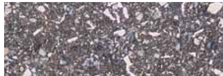
A80044 Ground Tudor® Finish : 36.3%