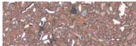
A80045 Ground Finish : 36.3%