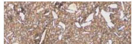
A80047 Ground Finish : 36.3%