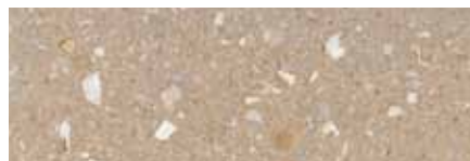
M3373 Ground Tudor® Finish