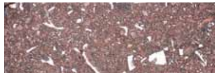
A80045 Ground Tudor® Finish : 36.3%