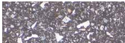
A80044 Ground Finish : 36.3%