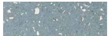
M3379 Ground Tudor® Finish