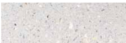
M3370 Ground Tudor® Finish