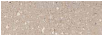
M3009 Ground Tudor® Finish

The colors shown are part of Hanover's Chesapeake Collection. Percentage of recycled content is based on the recycled materials used and varies for each color.